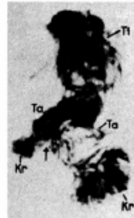
Fig. 2. Duplication of three distal tarsal segments with accompanying claws (Kr) in a bisected leg disc of a likewise 3 days 21 hours old D. hydei -donor larva, 8 days after implantation in the same age host larva. (In an attempt to bring 4 claws into one plane for the photographic image, the right tarsal branch was printed broadly.) Ta Tarsus, Ti Tibia. Arrow - point of bissection. 120/1

1. WADDINGTON 1 assumed that the palpi and antenna duplications observed by him developed from converted presumptive eye tissue. This does not appropriately apply to the duplications observed by me.