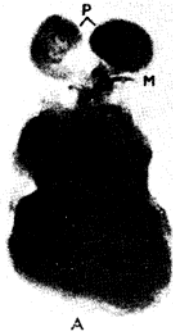
Fig. 3. Palpal duplication (P) in a bisected eye-antennal disc of a pupation ripe D. hydei -donor larva 6 days after implantation in an old larva. A eye, M maxilla. 80/1

The different organ fields keep for a long time their ability to be regulated differently. Thus, at the end of the third larval stadium, duplication of the palpi, but not the arista, still occurs (Fig. 3).