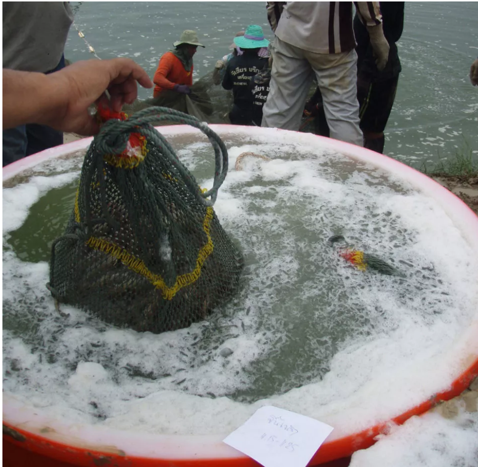
Whiteleg shrimp about to be stunned in iced water.

It is probable that the length of time of exposure to cold needed to render the animals insensible needs to be adapted to the size of the shrimp. Larger shrimp may need longer exposure time. The length of exposure should also differ depending on whether the aim of the stunning process is to cause temporary insensibility or death. A shorter exposure time to cold is likely to result in a reversible stun, which needs to be followed by a separate slaughter step (such as cooking or de-heading). Longer exposure time to cold can kill them in a combined stun-kill step.