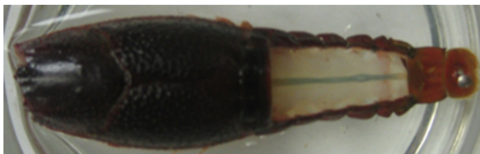
Figure 3: Dissected crayfish with GI intact.