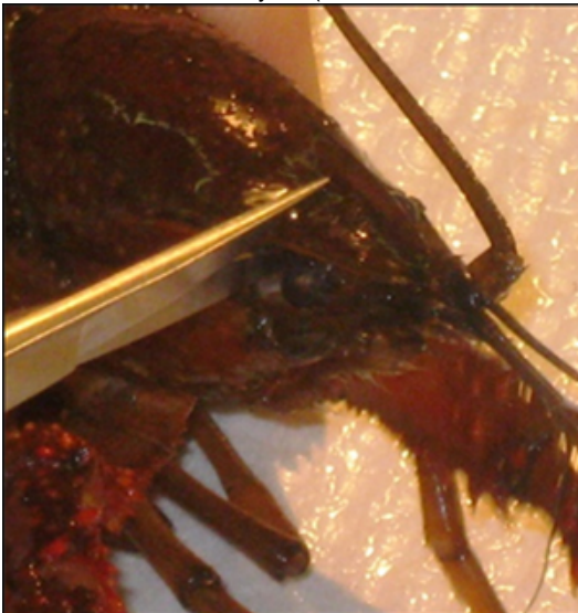
Figure 1: Decapitation of crayfish