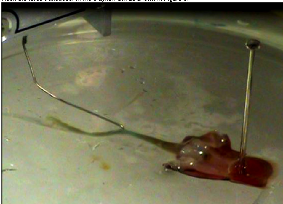
Figure 5: Isolated hindgut of the crayfish in saline attached to the hook of the force transducer